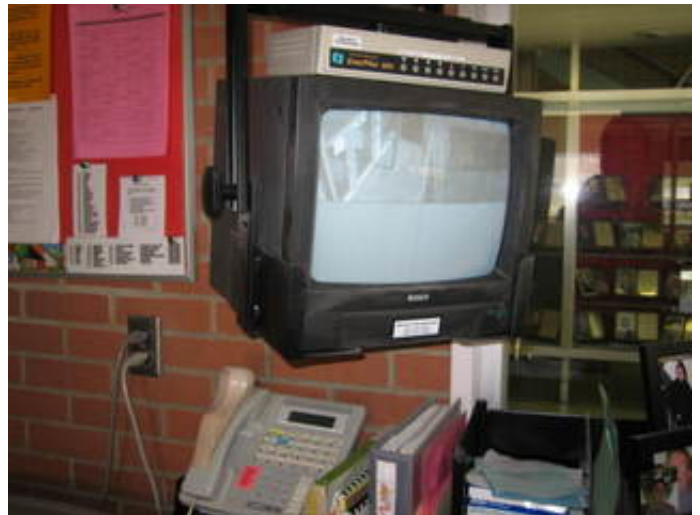
Security camera monitor