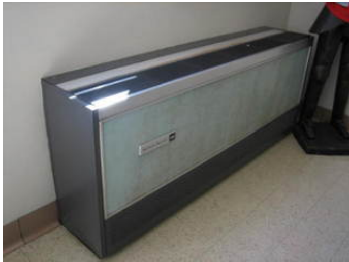
Classroom unit ventilators