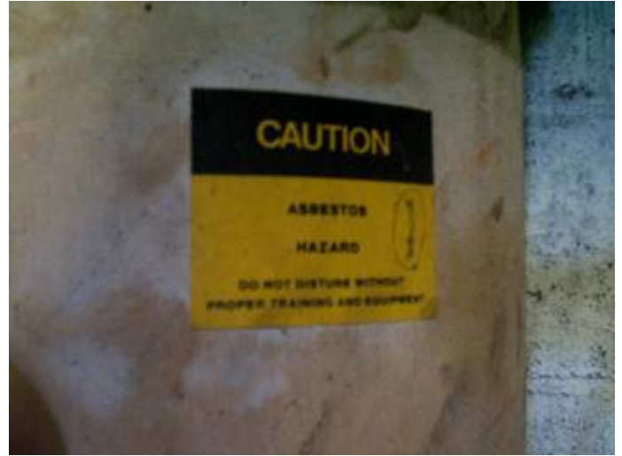
Asbestos label in boiler room