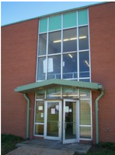
Curtain wall window system