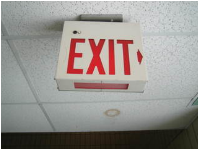
Ceiling mounted exit signage