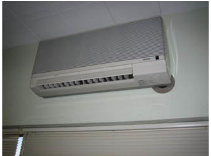
Packaged wall mounted air conditioning unit