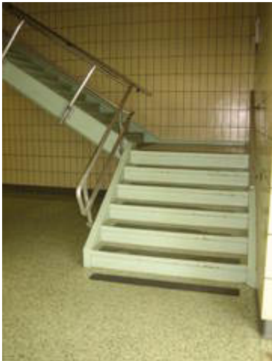
Non-enclosed stair with non-compliant handrails