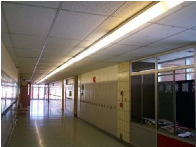
Typical corridor lighting