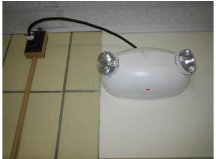
Emergency lighting fixture