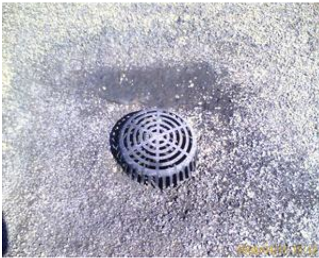
Typical roof drain condition