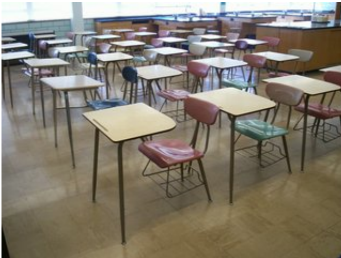
Student desk and chair in classroom