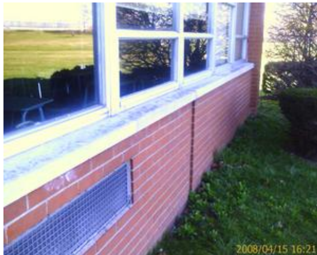
Typical stone sill