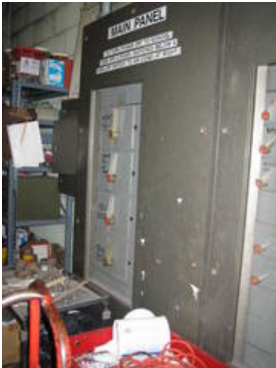
Main distribution panel