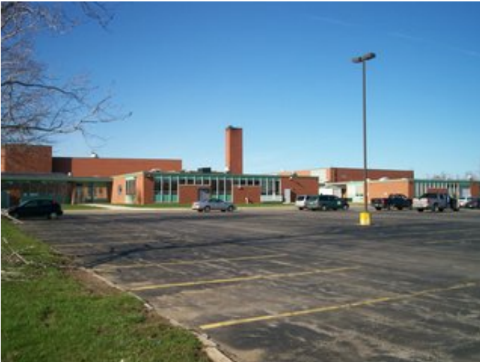
South elevation photo: