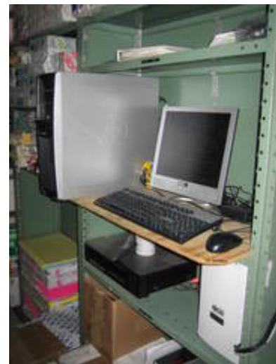
Security data collection system