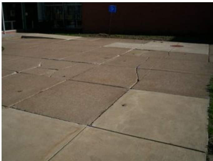
Concrete sidewalk in poor condition