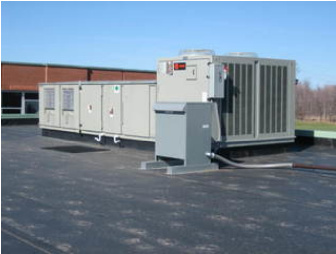
Rooftop packaged chiller unit