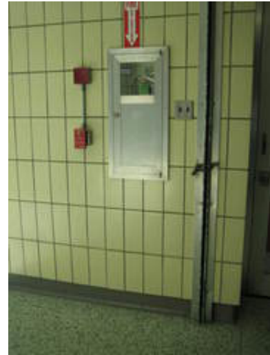
Fire alarm pull station