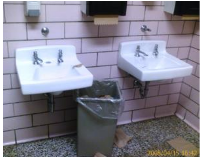
Typical fixture condition