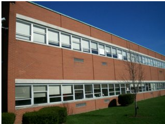
Typical non-insulated windows