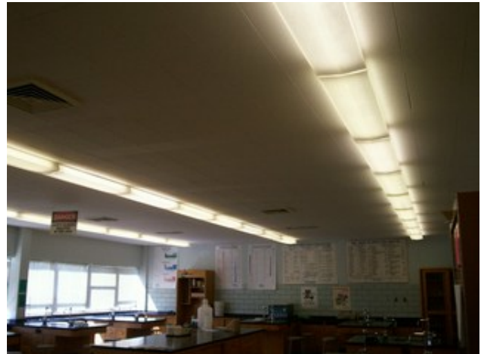
Typical classroom lighting