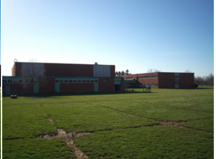
East elevation photo: