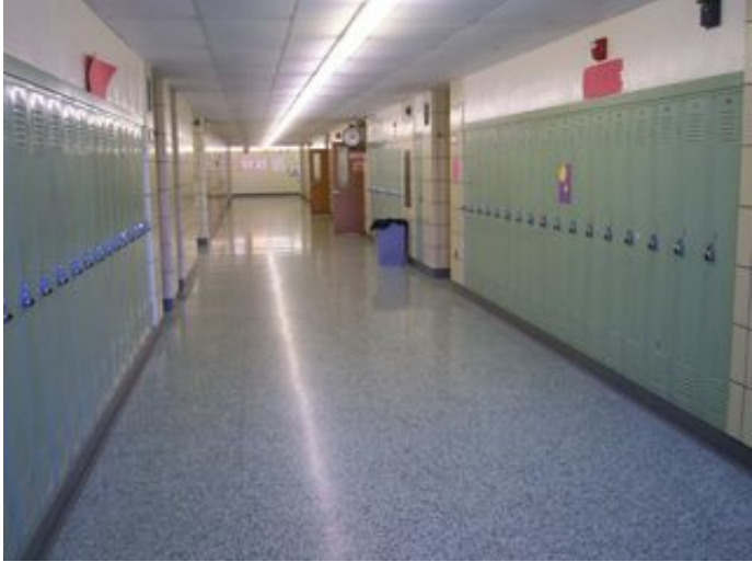
Typical corridor finishes