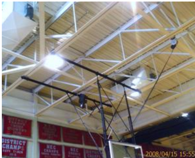
Typical metal deck roof structure