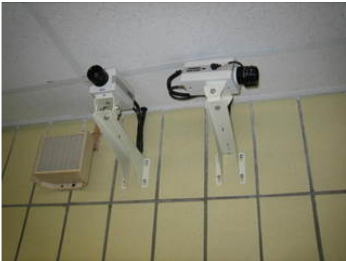
Corridor mounted security cameras