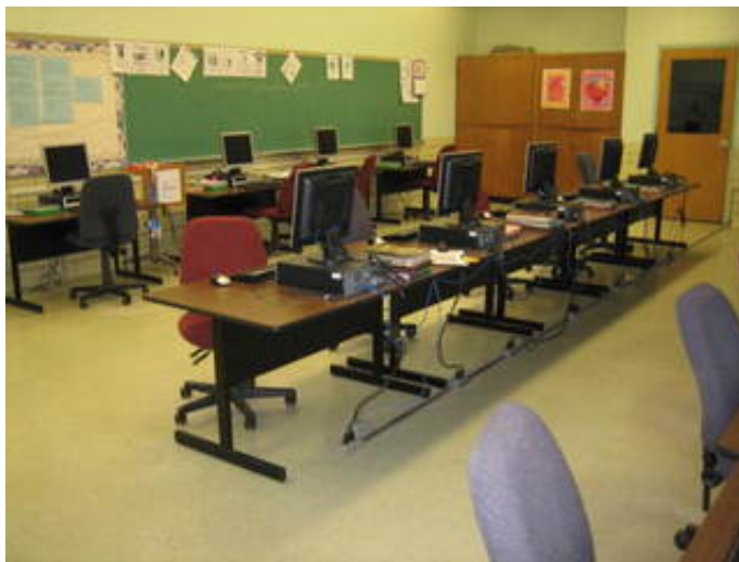
Business computer lab