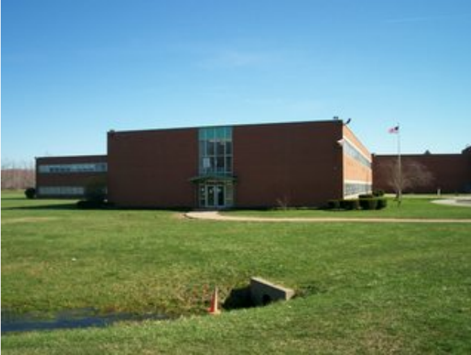
North elevation photo: