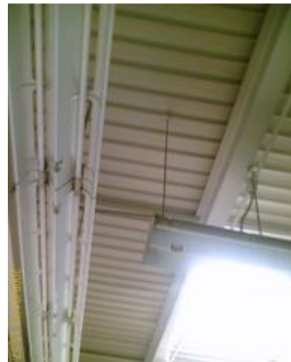
Typical metal deck roof structure