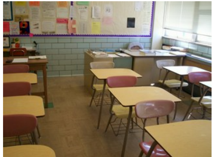
Teacher desk and chair in classroom