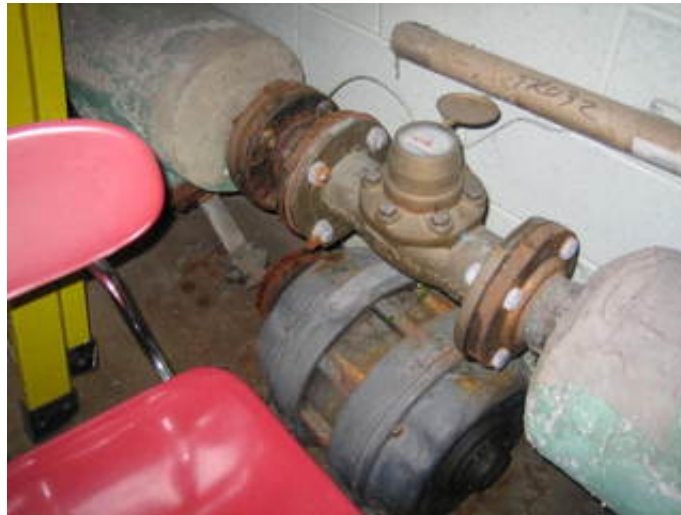
Water service entry