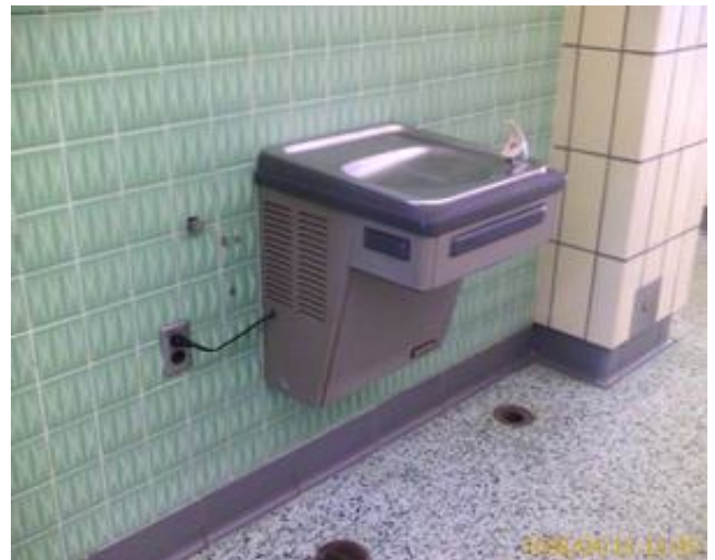
Typical electric water cooler