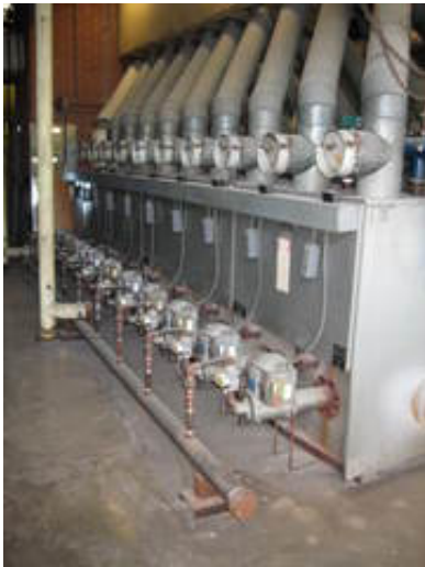
Natural gas boilers