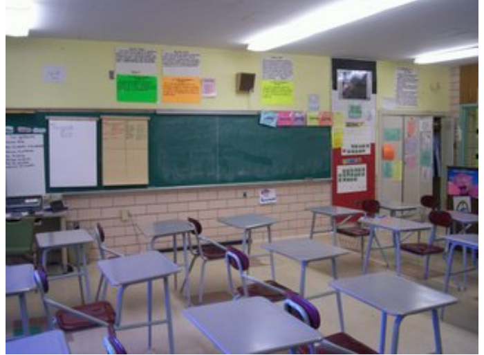
Typical classroom finishes