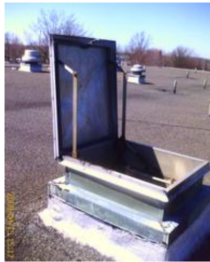
Typical roof hatch condition