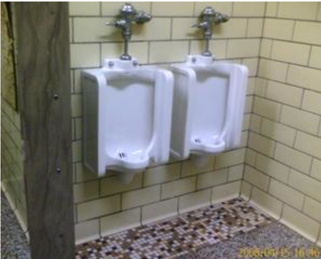
Typical fixture condition