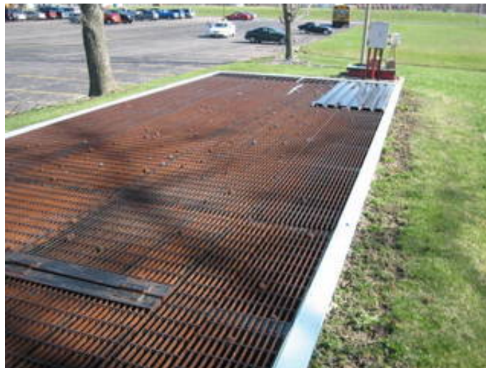
Waste water treatment plant