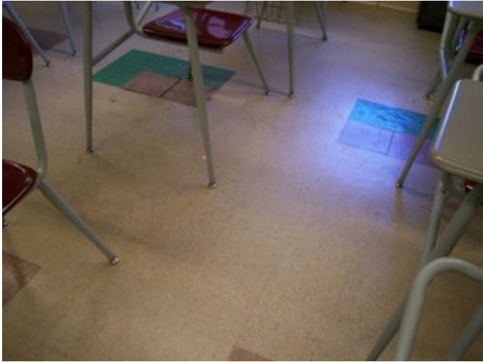
VAT in classrooms