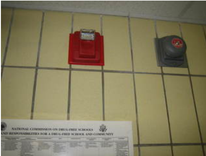
Corridor mounted horn/strobe device