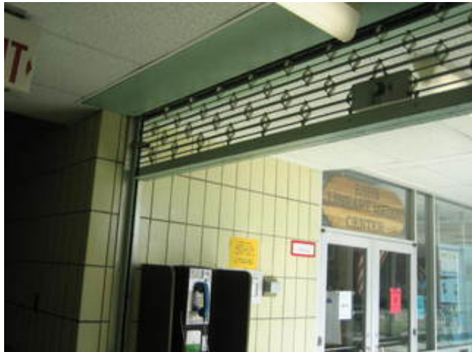
Corridor security gate