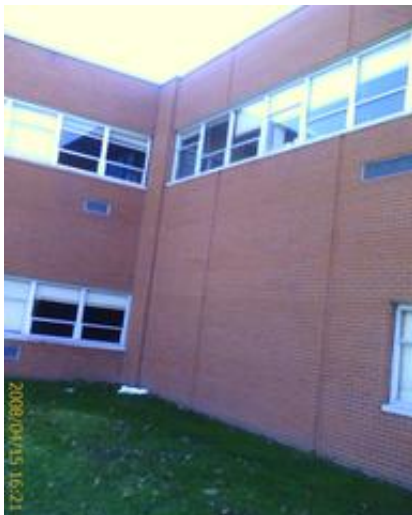
Typical exterior wall condition